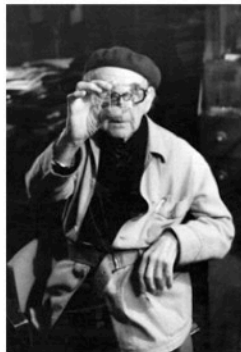
Man Ray by Arnold Crane

Museum of Encaustic Art , with proceeds going to support the FREE children's art education center/workshops.